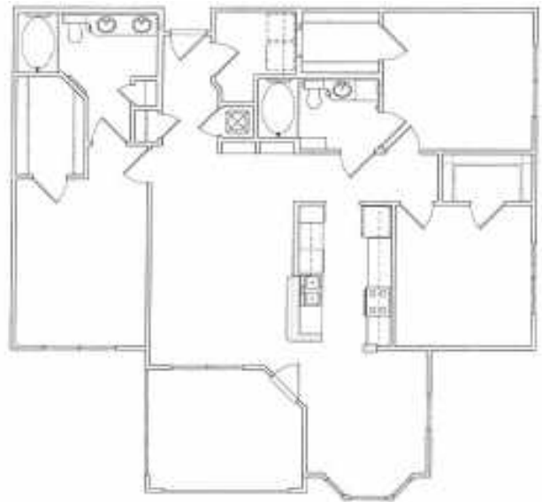
3 BR/ 2 BA The Fleming