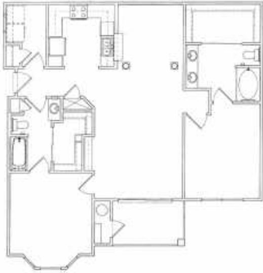
2 BR / 2BA, The Bishop